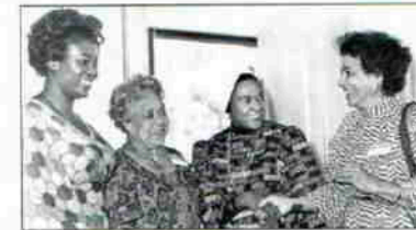
International Year of Women - Women's City Club - October 1976